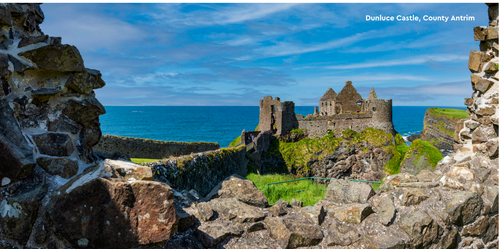
Dunluce Castle, County Antrim

The project must be compliant with the requirements of the Children First Act, 2015.